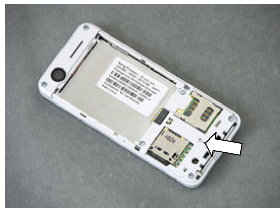
Location of the Liquid Intrusion Indicator. (Remove battery cover)